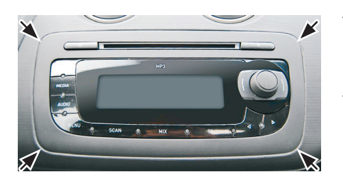
Special tools like radio release keys may be required.