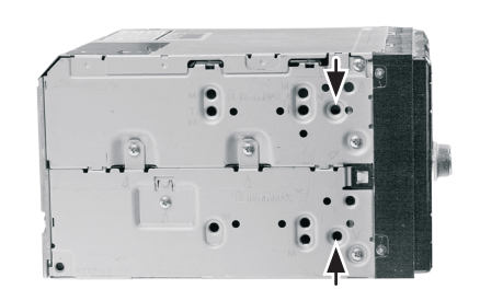
Mount the metal brackets with the double DIN head unit